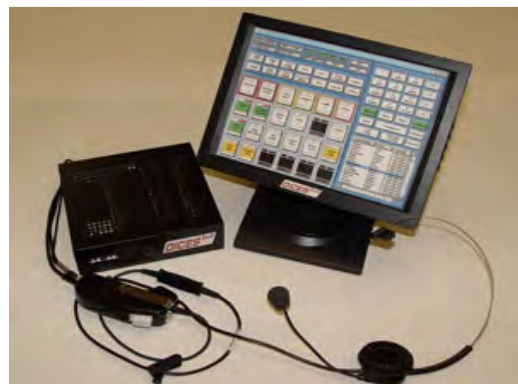
DICES VoIP User Station